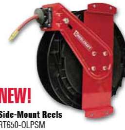
NEW! Side-Mount Reels RT650-OLPSM