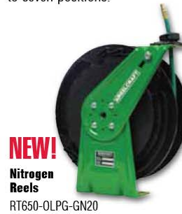
NEW! Nitrogen Reels RT650-OLPG-GN20