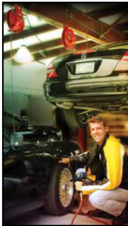
Fry's Napa AutoCare Center, Columbia City, IN