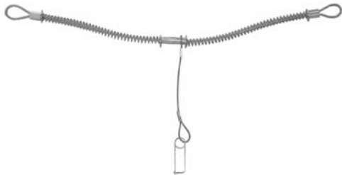
WB1C WB1 with safety clip and lanyard