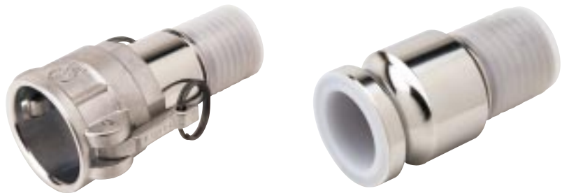
Teflon ® PFA Encapsulated Cam & Groove