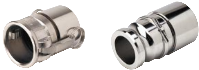
Stainless Steel Cam & Groove