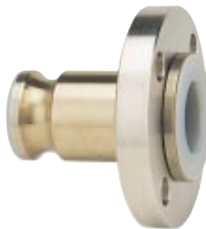
Flange X Cam Adapter PFA Encapsulated

Sizes available: 3/4\" through 3\", rotating flanges all materials (see page 23). Available Flange X Male Cam and Flange X Female Cam. Consult factory for information.